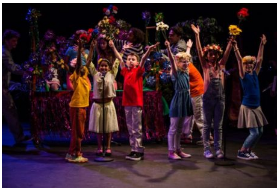
The children’s choir.

Running Time: Approximately one hour and 50 minutes, with no intermission.