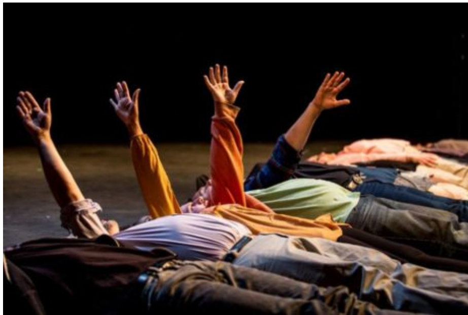
The company.