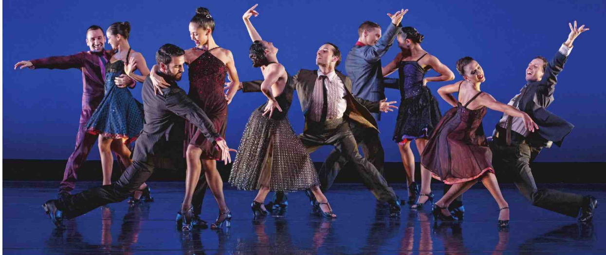
Ballet Hispánico performs Friday and Saturday at the Annenberg Center for the Performing Arts, returning to Philadelphia for the first time in nearly two decades.