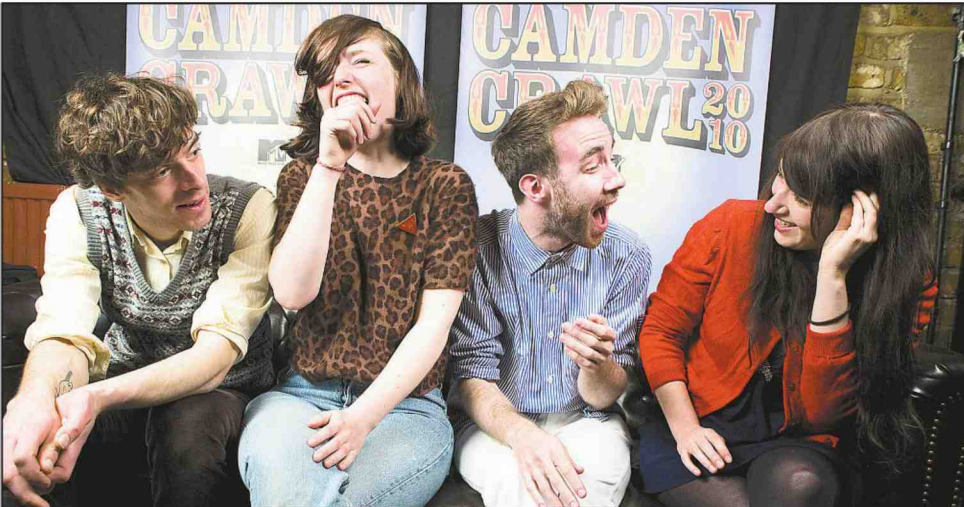
Veronica Falls , a London quartet, will play from "Waiting for Something to Happen" at Johnny Brenda's.