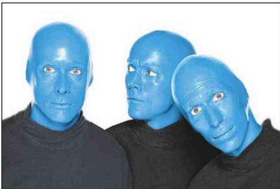
Blue Man Group , theatrical percussionists, will perform at Merriam Theater Tuesday through next Sunday.