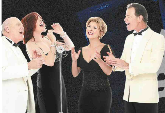
Manhattan Transfer performs Dec. 13 at the Keswick Theatre.