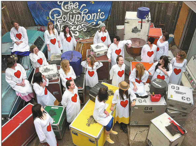
The Polyphonic Spree sings Dec. 14 at the Trocadero.