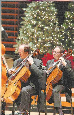
The Philadelphia Orchestra's annual concerts are a 50-year-old tradition.