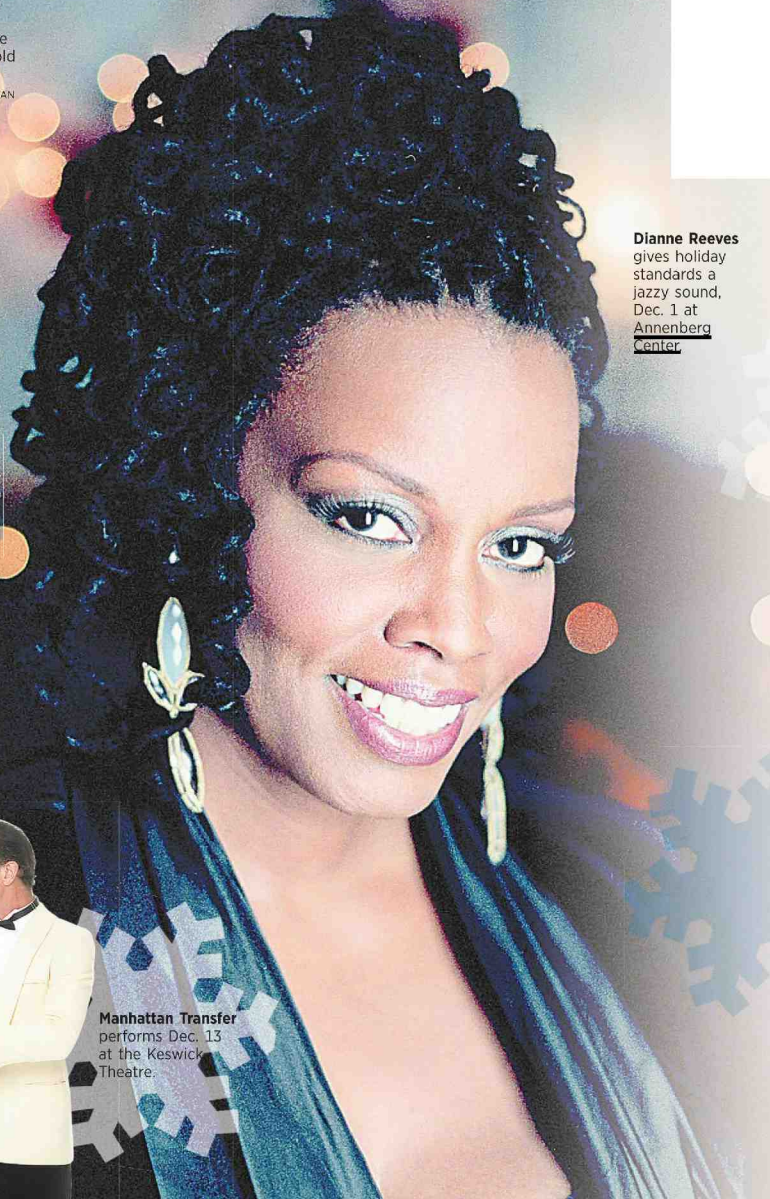
Dianne Reeves gives holiday standards a jazzy sound, Dec. 1 at Annenberg Center