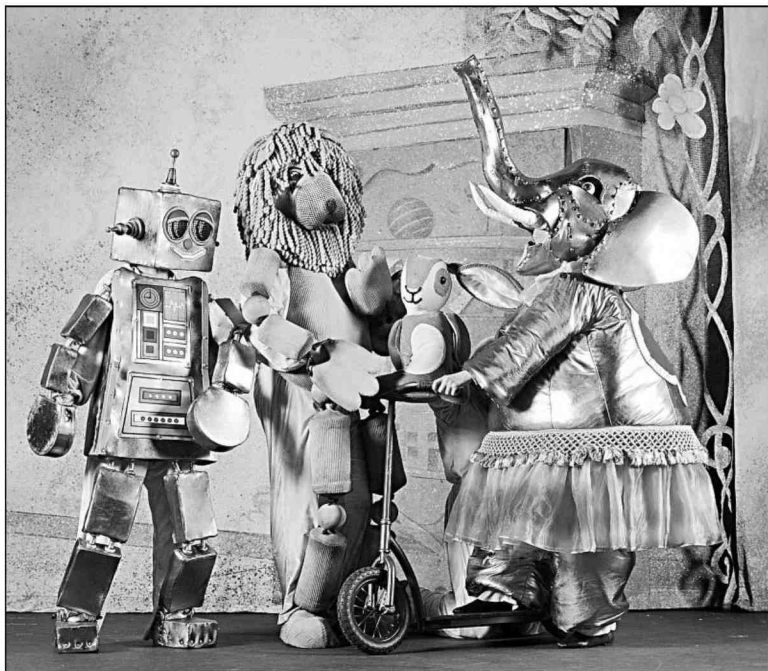
The Enchantment Theatre performs "The Velveteen Rabbit," the story of a worn plush toy that wishes to become real, at Bristol Riverside Theatre.