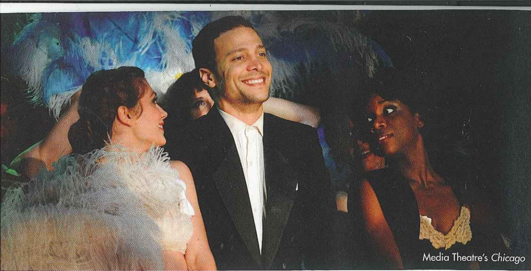
Media Theatre's Chicago