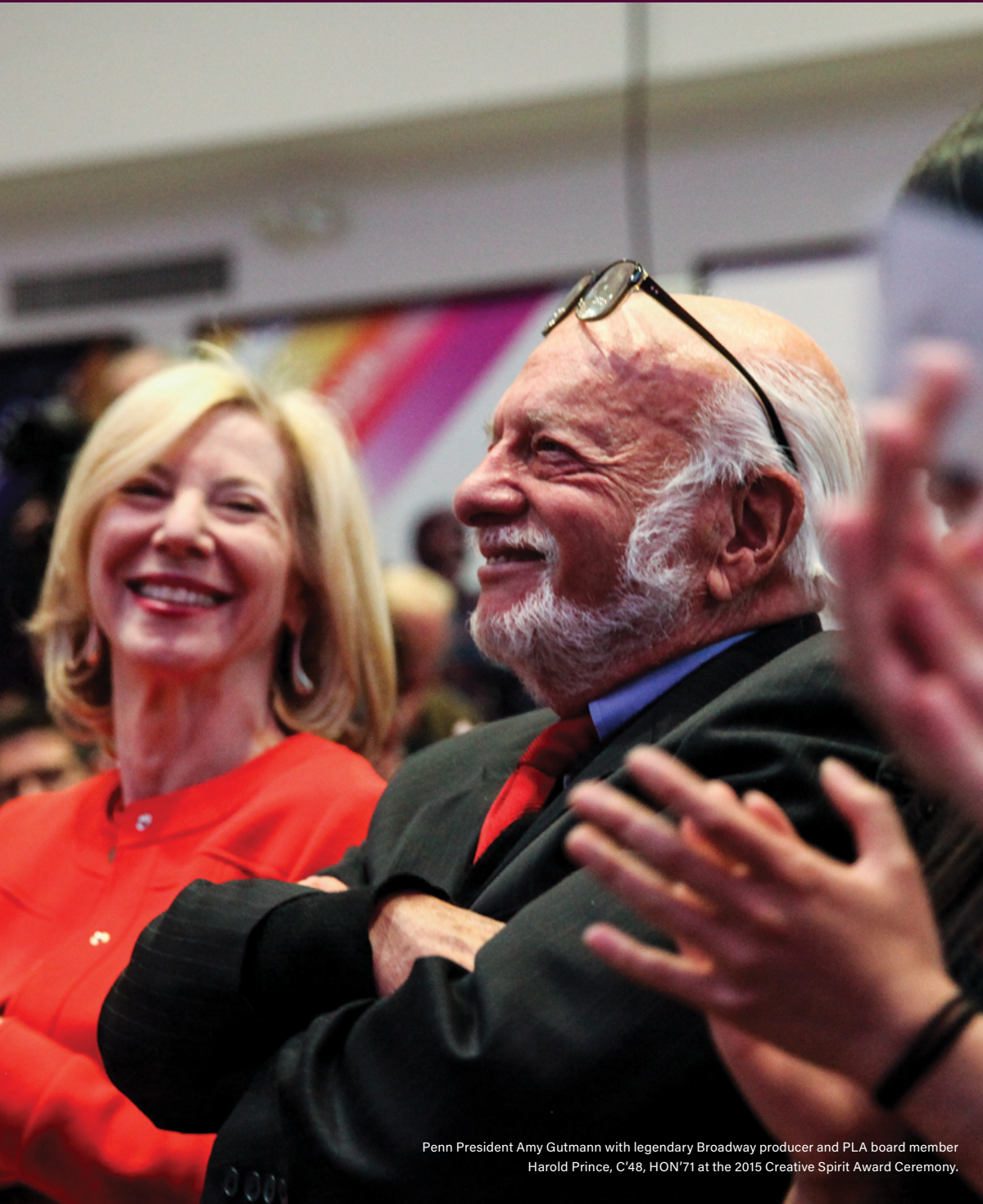
Penn President Amy Gutmann with legendary Broadway producer and PLA board member Harold Prince, C'48, HON'71 at the 2015 Creative Spirit Award Ceremony.