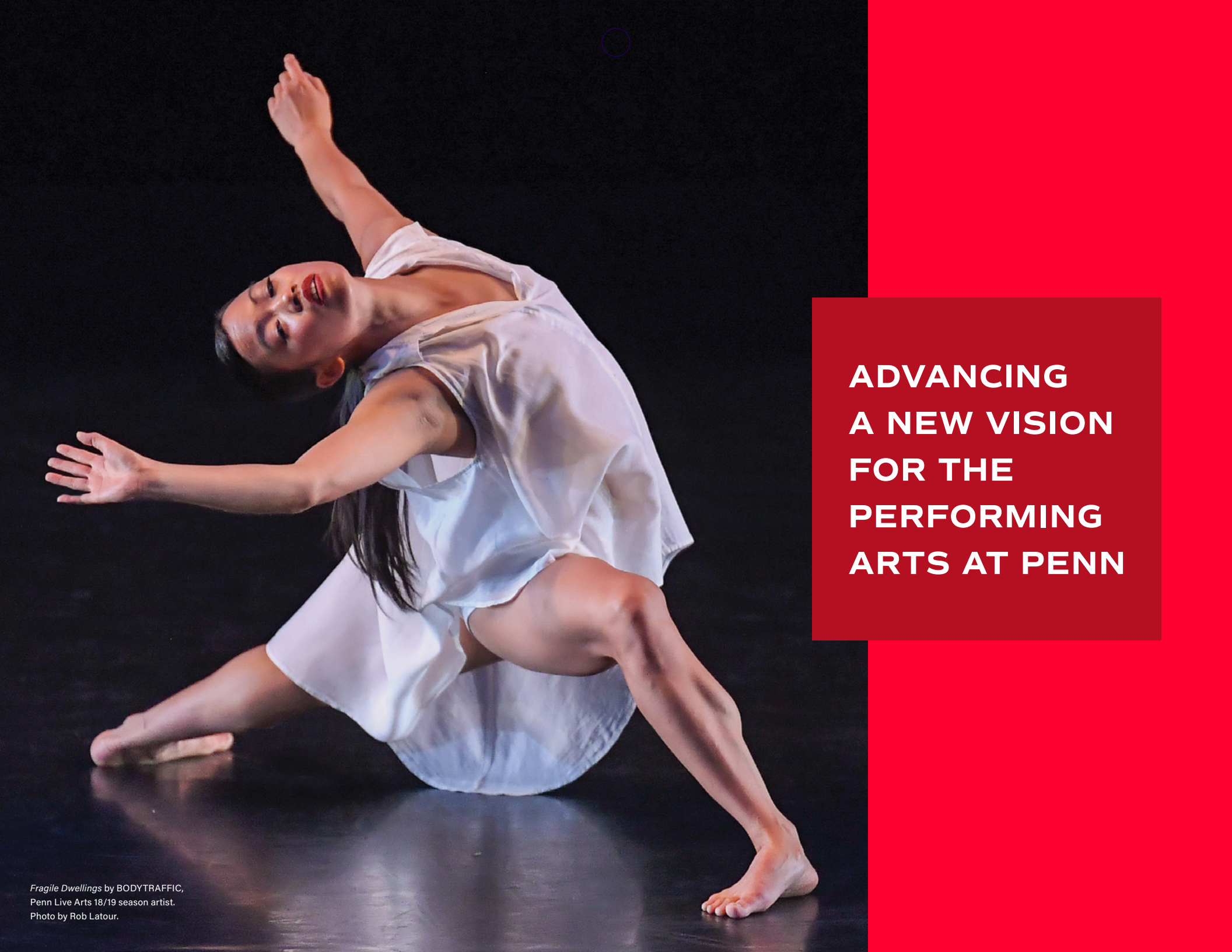
Fragile Dwellings by BODYTRAFFIC, Penn Live Arts 18/19 season artist.