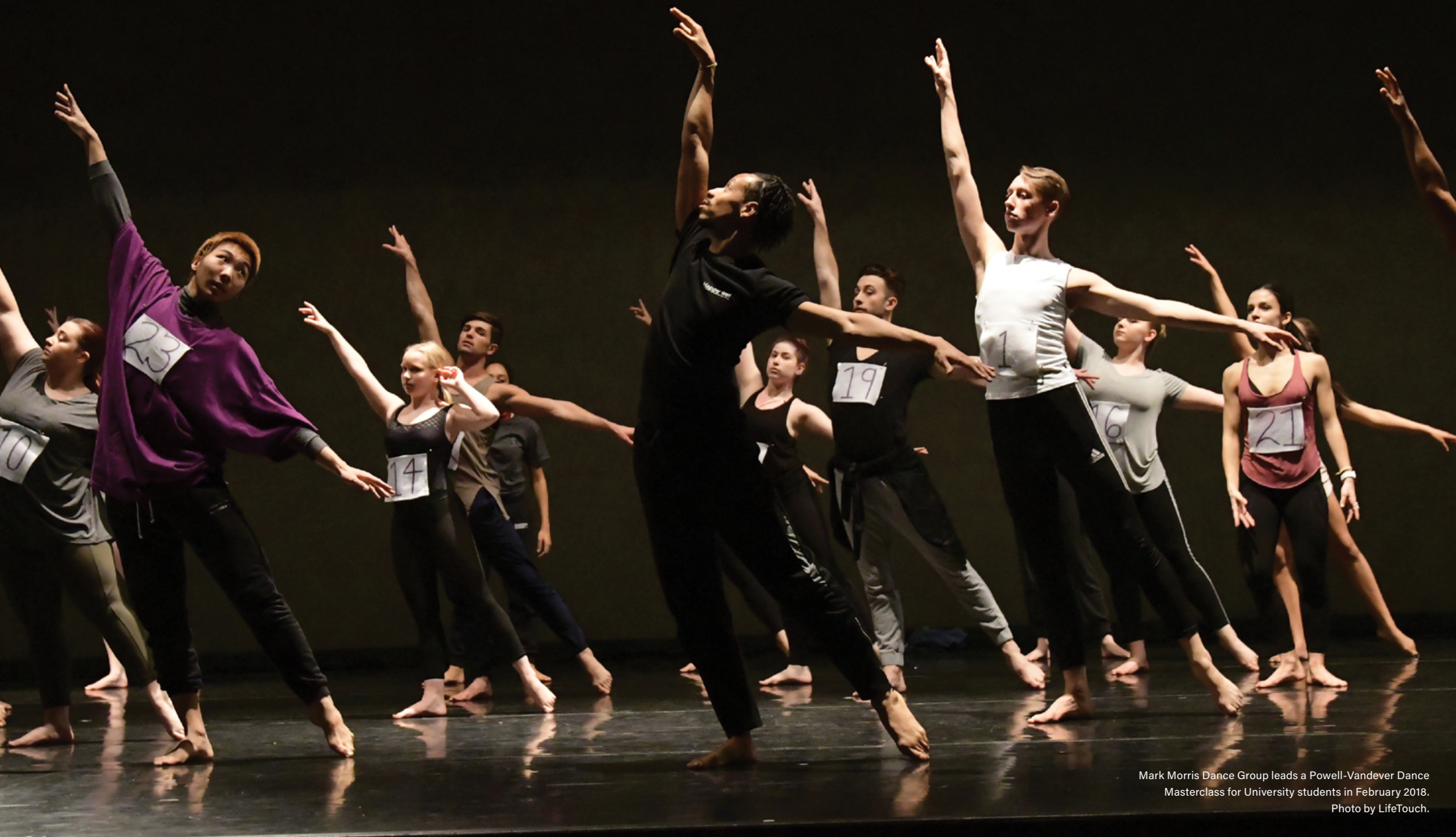
Mark Morris Dance Group leads a Powell-Vandever Dance Masterclass for University students in February 2018.