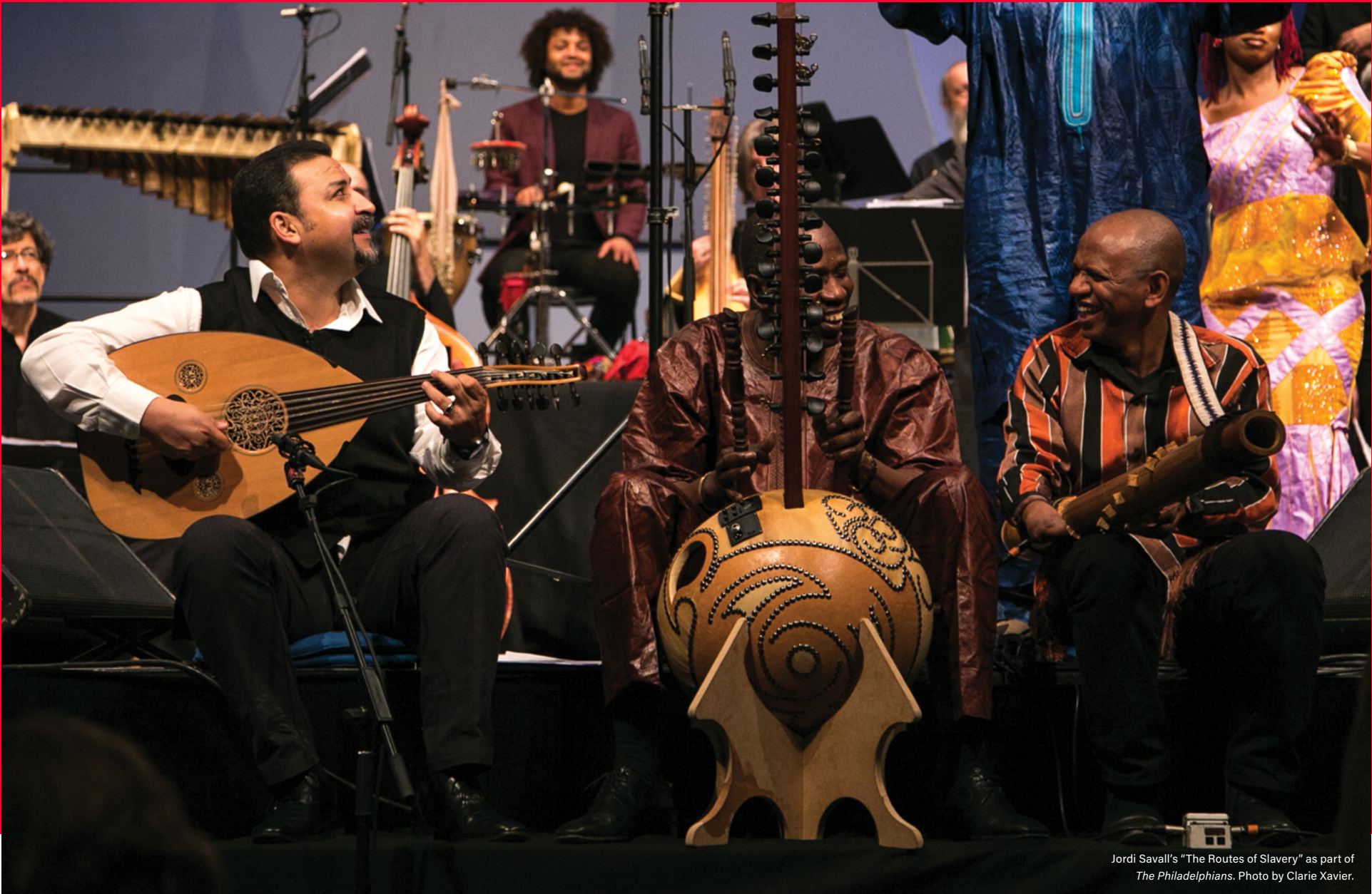
Jordi Savall's "The Routes of Slavery" as part of The Philadelphians.