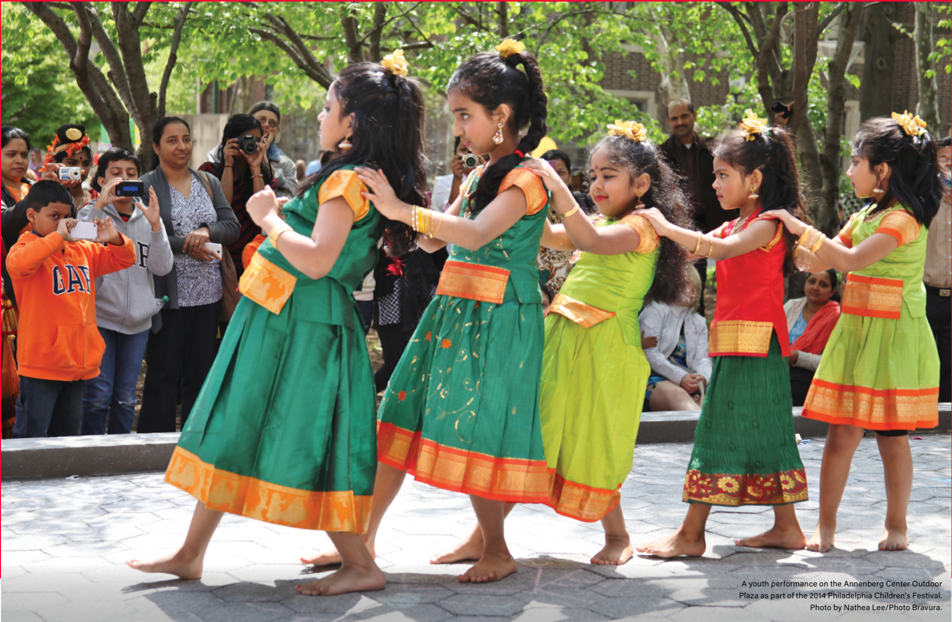
A youth performance on the Annenberg Center Outdoor Plaza as part of the 2014 Philadelphia Children's Festival.