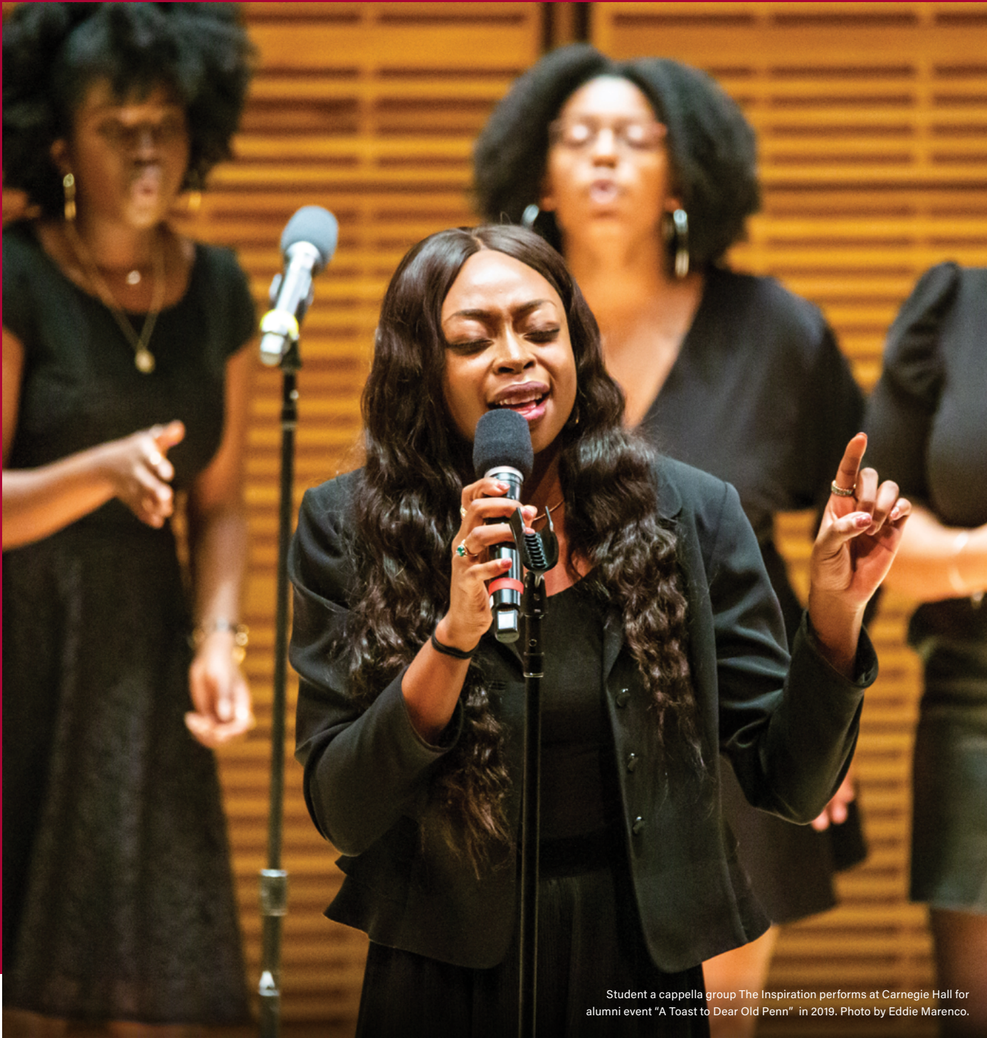
Student a cappella group The Inspiration performs at Carnegie Hall for alumni event “A Toast to Dear Old Penn” in 2019.