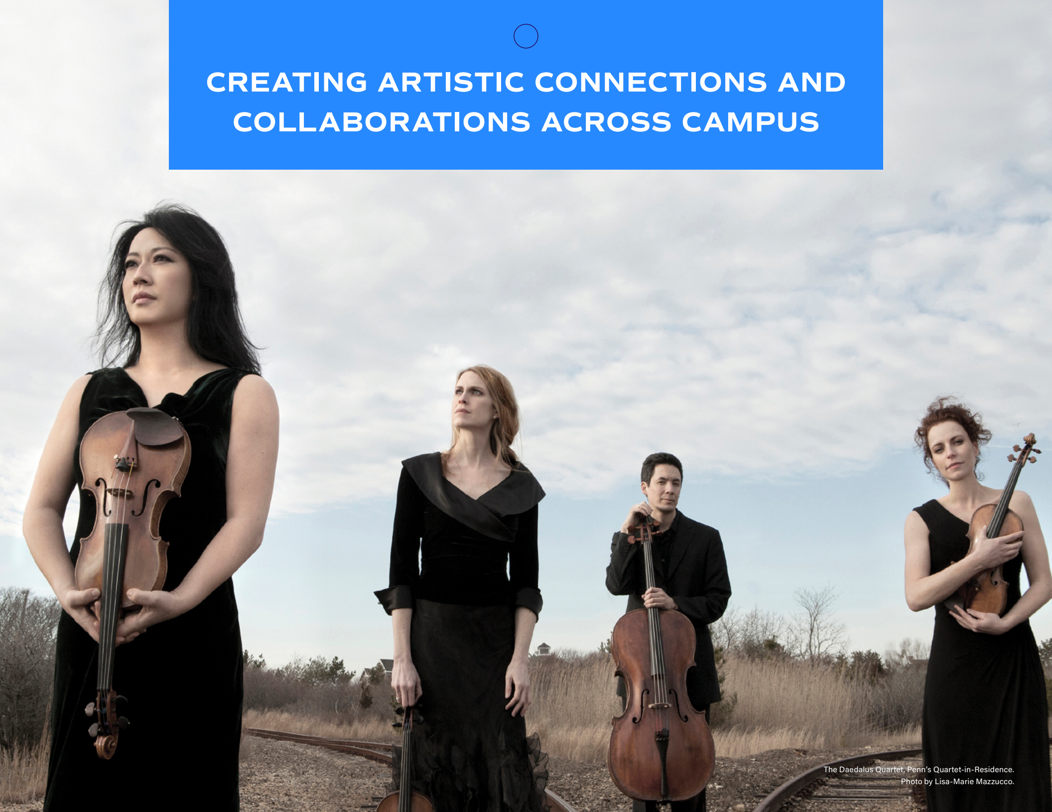
The Daedalus Quartet, Penn's Quartet-in-Residence.