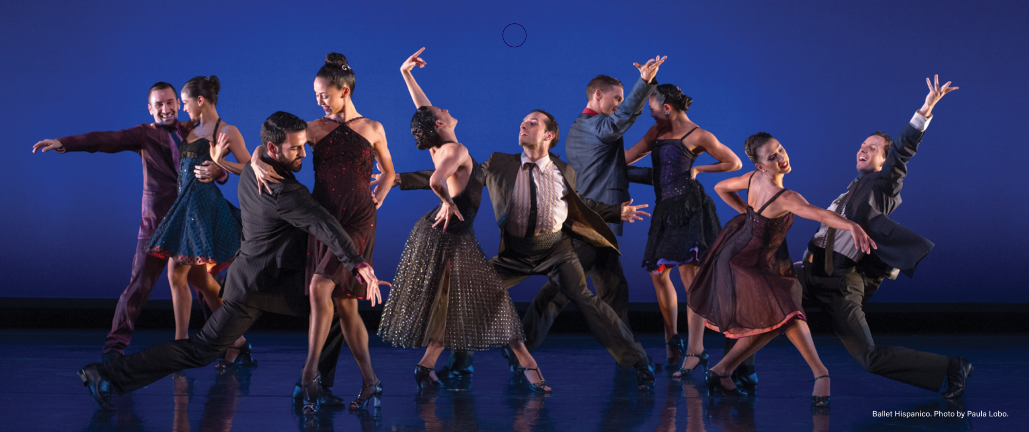
Ballet Hispanico.