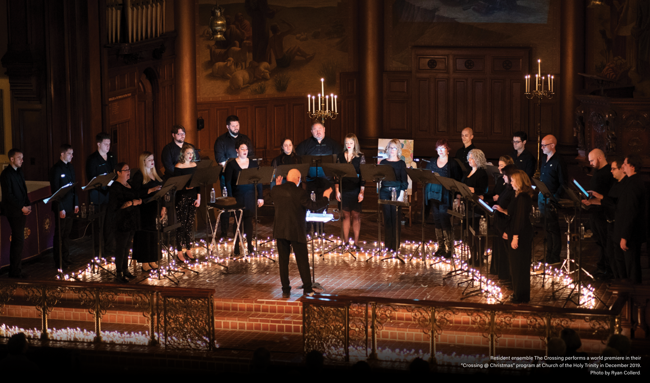
Resident ensemble The Crossing performs a world premiere in their "Crossing @ Christmas" program at Church of the Holy Trinity in December 2019.